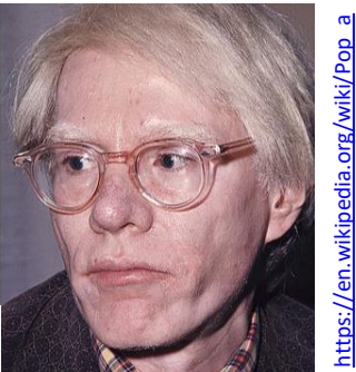
Andy Warhol is probably the most famous figure in pop art. In fact, art critic Arthur Danto once called Warhol "the nearest thing to a philosophical genius the history of art has produced." Warhol attempted to take pop beyond an artistic style to a life style, and his work often displays a lack of human affectation