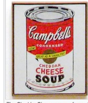
The Cheddar Cheese canvas from Andy Warhol's Campbell's Soup Cans, 1962.

Andy Warhol was an American artist, film director, and producer who was a leading figure in the visual art movement known as pop art. His works explore the relationship between artistic expression, advertising, and celebrity culture that flourished by the 1960s,